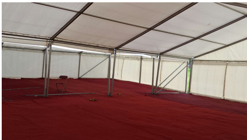
Figure 2: Internal view of marquee

The primary area of cost was the hiring of the marquee, double the size of the one hired for the previous Eid Salâh . Despite the adverse weather conditions, a great number of people still attended with the tawfeeq of Allah, which was a very promising sight. All of the attendees (about six hundred) thus prayed under the marquee.