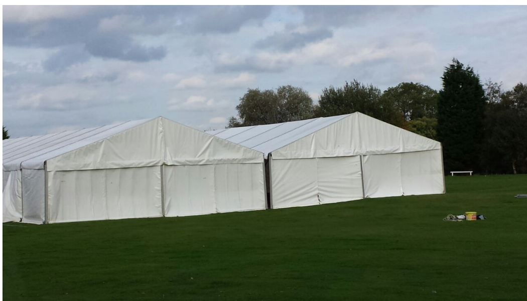
Figure 1: An external view of the twin-marquee, each one accommodating about 7 rows.

Eid al-Adh-Hâ (10 th Dhul-Hijjah 1435 AH) was on Saturday 4 th October 2014 and the venue of the Eidgah was left unchanged as Deane and Derby Cricket Club on Chelsea Road, Great Lever, Bolton. The time of the Salâh , however, was changed to 7.45 am to allow more time after the prayer for people to perform UdhHiyah (sacrifice) if they so wished. The Salâh was preceded by a speech which lasted approximately half an hour.