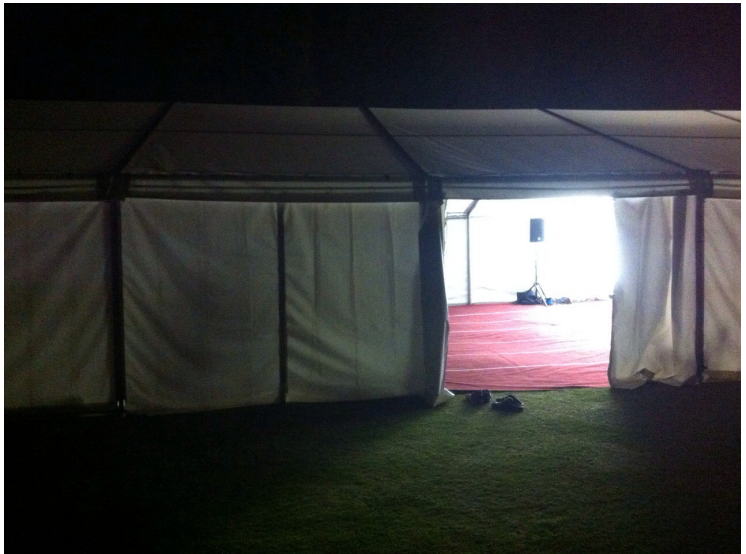
Figure 2: The marquee after installation of PA system and carpet

The total income from the generous donations amounted to £3346.70 and the total cost amounted to £3347.11. A full account of income and expenditure, including where and how the money was procured and spent, is given below.