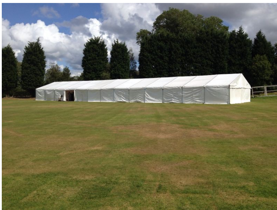
Figure 1: Exterior view of the marquee at Deane and Derby Cricket Club

The Eid Salâh took place at 9.00 am on the morning of Eid-ul-Fitr , which fell on Monday 28 th July 2014, at the Deane and Derby Cricket Club, which is located on Chelsea Road in the Great Lever area of Bolton. The turnout was very good as it is estimated that close to a thousand worshippers attended the congregational prayer.