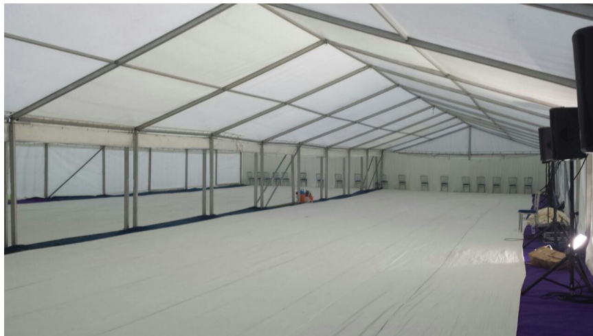
Figure 3: Internal view after the PA system and rows have been put in place

Volunteers were organised into three groups; one for car parking, one on the grounds, and one in the marquee. Each group was assigned a leader and a meeting took place before Eid during which each person learnt their roles. Volunteers also helped with the distribution of leaflets and posters and keeping watch of the marquee and equipment from Thursday afternoon.