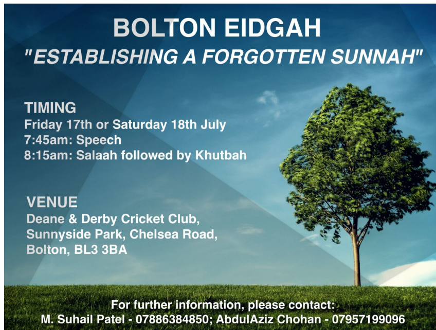
Figure 1: The campaign poster that was used prior to the Eidgâh

During Ramadhân 1436, a campaign was initiated to raise awareness about the need for the Eid Salâh to take place at the Musallâ and the need for the Muslims of Bolton to be a part of the revival of this Sunnah. Social media platforms, such as Whatsapp, Facebook and Twitter were utilised for this purpose, and posters, including details of time and venue, were put up in shop windows in prominent locations around Bolton.