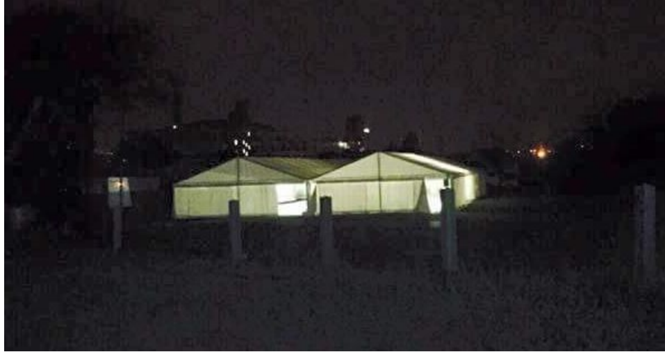
Figure 7: A night-time shot of the marquee

We must make an effort to be a part of the Eidgâh ourselves and also relay the importance of attending to others, so that each Eid Salâh attracts more Muslims than the one preceding it. Thanks are due to the volunteers who, with permission from Allah, gave their time and efforts to ensure everything ran smoothly. We pray that Allah accepts our humble efforts in participating in the revival of the Sunnah of performing Eid Salâh at the Musallâ, and that He allows it to continue for many years to come, not only in Bolton but in other towns and cities across the world.