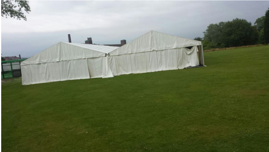
Figure 2: External view of the marquee. The sides would presently be lifted for the prayer

The marquee, under which the Salâh would take place, was set up at about 5.00 pm on Thursday 16 th July. A twin marquee was used which could accommodate about fifteen rows and hence one thousand worshippers. Shortly after, the cloths with pre-marked rows were laid by volunteers and the sound system was also set up by a hired company.