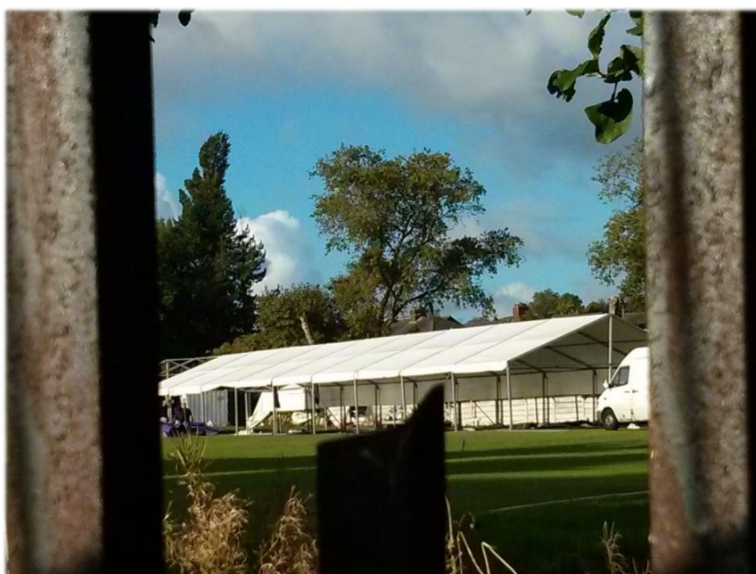
Figure: The cricket field with the marquee, part way through assembly

As can be seen from the poster image above, the time of the Salâh was 7.45am. A short speech was given before the prayer while attendees were still making their way towards the Eidgâh. Despite the dreary and wet weather, there was a relatively large turnout for the Eid Salâh, with about three-quarters of the twin-marquee being filled with worshippers.